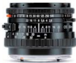
CFi 2.8/80 mm